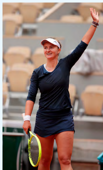
Barbora Krejckova (CZE).