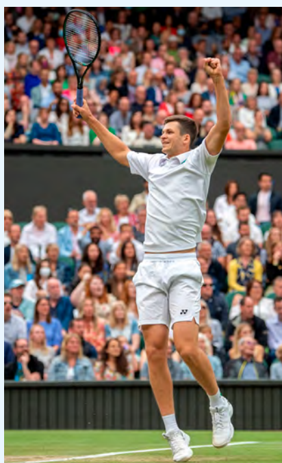
Hubert Hurkacz (POL).