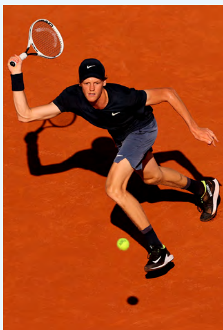
Jannik Sinner (ITA).