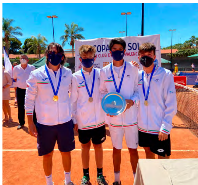
Italy with medals.