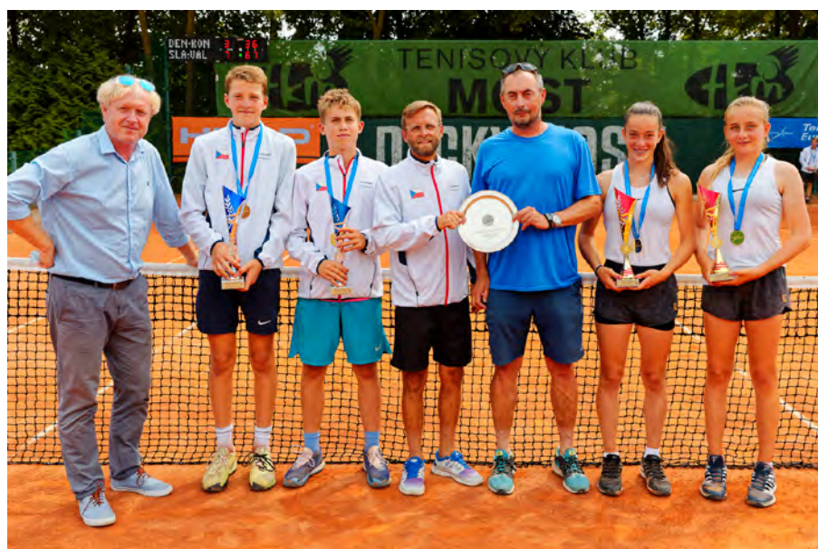
The Czech team celebrates its success in Most.