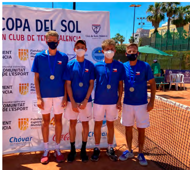
Boys' runners-up Czech Republic.

The Czech boys' team showed no signs of slowing down, doing one better in their semi-final ousting Switzerland