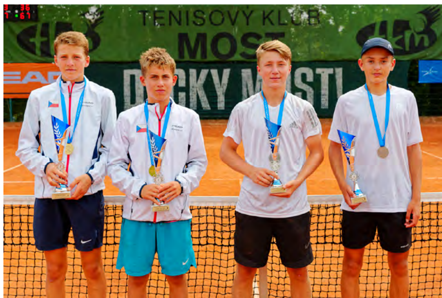
Boys doubles finalists in Most.