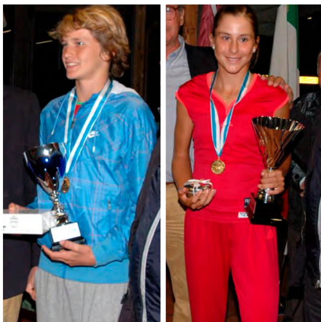
Zverev and Bencic, Junior Masters champions 2011.

Barbora Krejckikova & Katerina Siniakova (CZE) withstood the pressure as pre-tournament favourites and kept their form coming into the event going by winning gold in the Women's doubles. Surprisingly, this was the first-ever